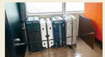
Handy luggage storage